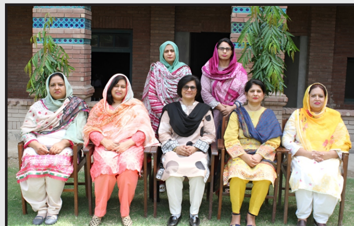
Head of Department Advisor Controller