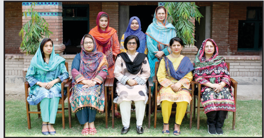
Head of Department Advisor Controller

INTRODUCTION: The Department of Economics is providing a visionary landscape to achieve excellence in the field of Economics. We are the proud custodians of academic integrity and excellence in our college. We built such grounds that help our students to apply their theoretical knowledge in the practical horizon and resolve the economic bugs in our surroundings. Our mission is to nourish the intellectual capacity of our students to its fullest. Hence, they will be able to unlock the art of discipline in life, rationalization in thought process, scholarly decisions, and compact goals. We focus on enabling the analytical skills as most of our courses are designed with scientific proof of theoretical philosophy of Economist and Economic principles.