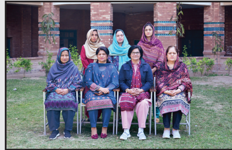
Head of Department Advisor Controller

INTRODUCTION: Come and explore the world of opportunities for study and research in Mathematics, as our Department of Mathematics facilitates students with the training in mathematics and statistics necessary to achieve their goals being mathematicians. With a commitment to both theoretical exploration and practical problem-solving, the department offers a diverse range of courses. Students can delve into areas such as algebra, calculus, statistics and beyond, gaining essential skills for a variety of academic and professional pursuits. We offer quality programs of mathematical specialization at every level and our faculty is committed to teach the students. It is our mission to provide quality education in mathematics and produce educated leaders – the change agents of tomorrow.