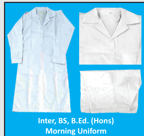
Inter, BS, B.Ed. (Hons) Morning Uniform