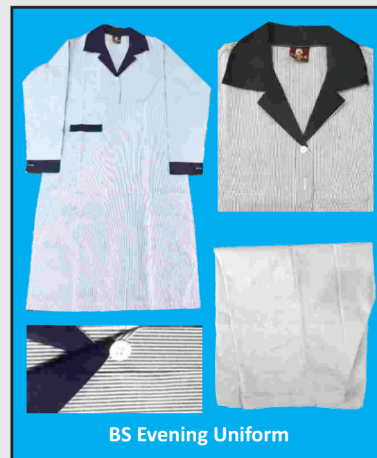
BS Evening Uniform