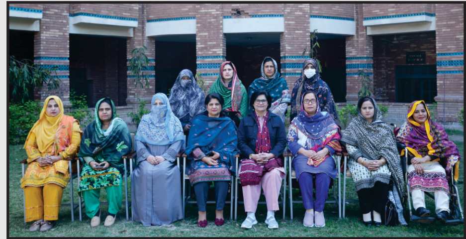
Head of Department Advisor Controller

INTRODUCTION: Pakistan came into being in the name of Islam. The department of Islamic Studies reflects the ideology of Pakistan. Islam is a complete code of life and all the contemporary issues can be solved in the light of the holy Quran and Sunnah. Islamic Studies is being taught as a compulsory subject in different faculties. BS Program in Islamic Studies was started in 2018. Every year seminars, Seerat Conferences, Milad-un-Nabi ﷺ, Qirat and Naat competitions are organized by the department. Our students participate in every competition and win laurels Alhamdulillah. We aim at inculcating tolerance and empathy in our students so that they may play a constructive role in our Islamic society.