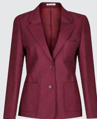
Maroon Blazer/Coat Inter Section