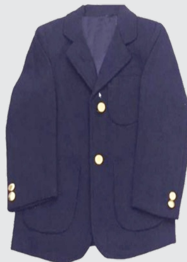
Blue Blazer/Coat BS/B.Ed. (Hons) Morning & Evening